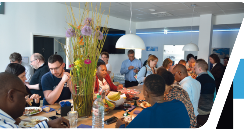
Impressions from 2019 – 2021 User Group Meetings We organize them since 2005, they take place twice per year